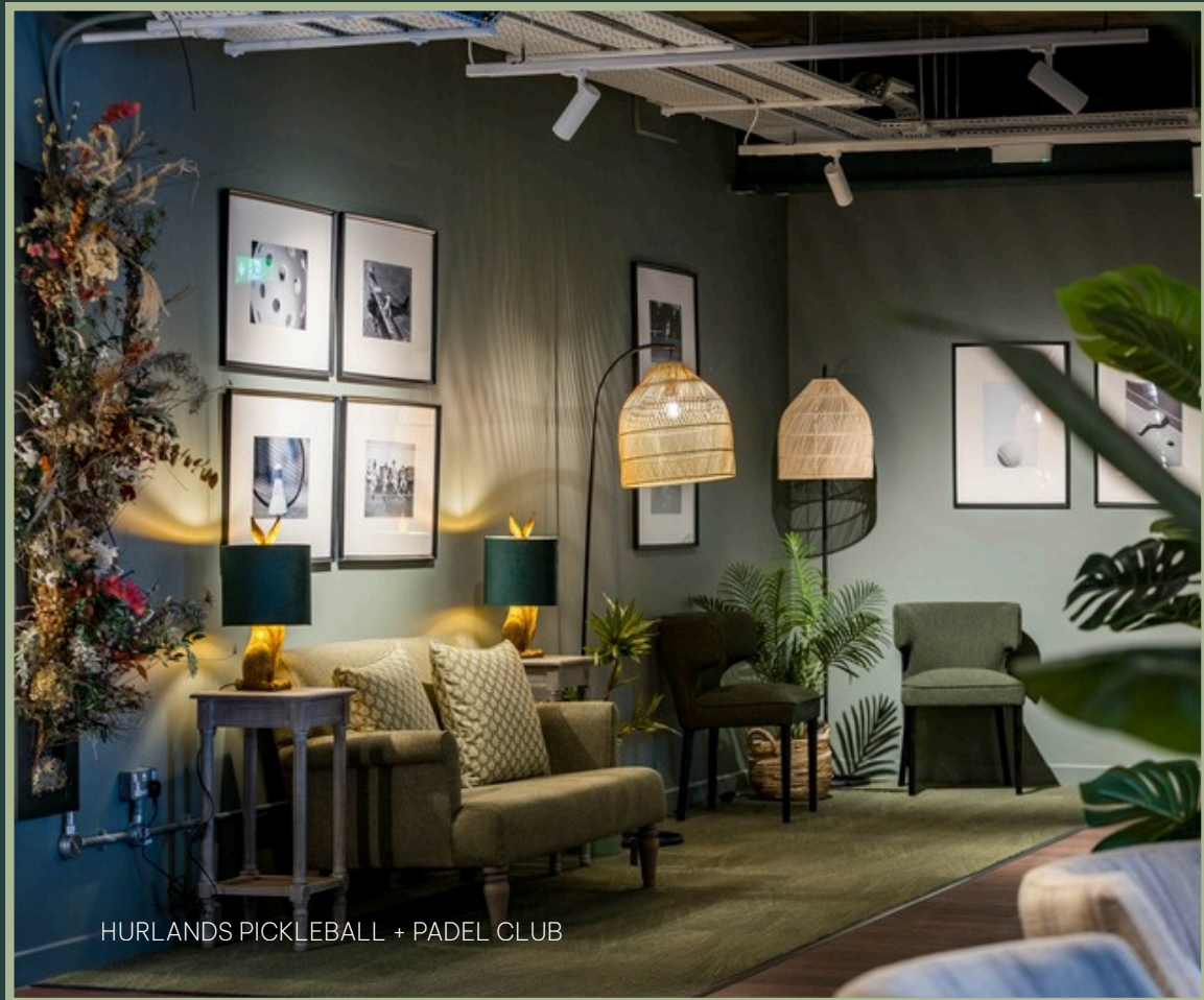
HURLANDS PICKLEBALL + PADEL CLUB